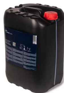
25 kg drums

Photos: Available in several packages (Sizes may differ from markets)