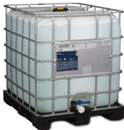
1000 kg IBCs